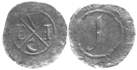
Copper 1 Anna Ticket