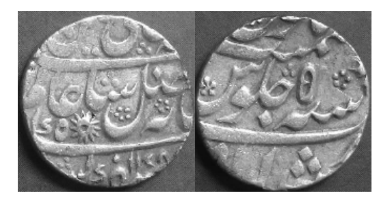
Rupee of Shah Alam II, RY 5

The three pictures above show that different coins have different dot arrangements in the top line of the obverse. The first has two dots to the right and three to the left, the second has two dots to the right and two to the left, and the third has three dots to the right and two to the left. The full set of information discovered so far is given in the following table: