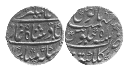
Gold 'Kalkutta' Mohur, RY 5

In September 1757, Messrs Frankland and Boddam were appointed joint Mint Master<sup>28</sup> and the mint swung into full operation sending 3050 Rs to Cozimbazaar for the approval of the Nawab and five to London<sup>29</sup>. At the same time the mint was supplied with 35,000 old (Sonaut) rupees and 805 Persian rupees for recoining, and in October a further 50,000 old rupees were sent to the mint<sup>30</sup>. Also in October a significant amount of gold that had been received from the Nawab was sent to the mint where it was to be coined into Fooley (i.e. star or flower) mohurs<sup>31</sup>.