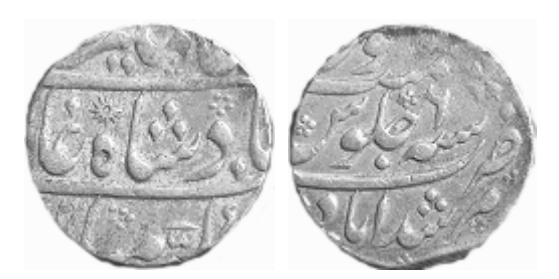
Murshidabad Rupee, Alamgir II RY 6

From the above disussion, it seems clear that the Calcutta mint starting producing Murshidabad rupees early in 1761, before agreement was reached to produce coins in the name of Shah Alam II. During the first half of 1761, therefore, these Murshidabad rupees would have been struck in the name of Alamgir II, regnal year 6. The question is, can we differentiate those coins struck at Calcutta from those struck at Murshidabad? A typical Murshidabad sicca rupee is shown below