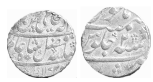
Normal Murshidabad Rupee of Shah Alam II, RY 2

From July 1761, the Calcutta mint started striking Murshidabad rupees in the name of Shah Alam II and these coins showed his second regnal year. Again, the question arises, how to distinguish between those coins struck at Murshidabad and those struck at Calcutta? A normal Murshidabad rupee is shown below: