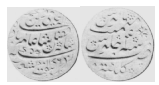
Rupee of Shah Alam, AH 1176, RY 4. Mintname Kalkutta

Both coins appear to be very neatly struck and could possibly have been a presentation pieces for the Nawab.