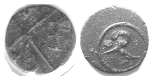
Copper 2 Pice Ticket

and a smaller denomination has been identified by Kathotia<sup>33</sup>