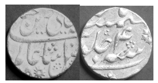
Rupee of Shah Alam II, RY 4