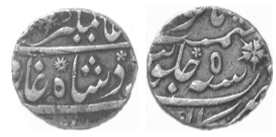
Five sun 'Kalkutta' Rupee

Notice to be given that after the 23^{rd} inst. Five sun siccas will be rec'd into the Company's treasury at 13 p cent batta only and that six sun siccas will be struck & pass current from that day