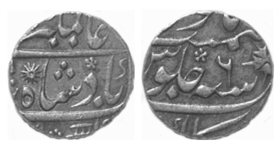
Six sun 'Kalkutta' Rupee

Coins with the Mint Name Murshidabad Struck in the Calcutta Mint