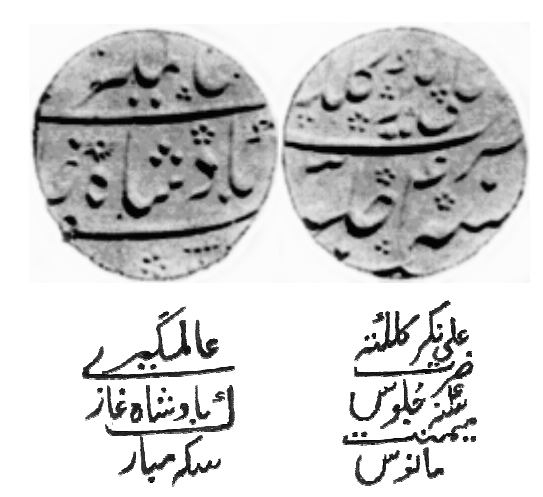
'Alinagar Kalkutta' Rupee, RY 4 of Alamgir II

The coins struck at this time must have been the very rare rupees with the mint name Alinagar Kalkutta