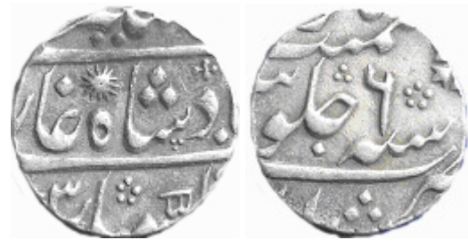
Murshidabad Rupee, Alamgir II, RY 6. Three dots below Shah and extra dots on reverse

From July 1761, the Calcutta mint started striking Murshidabad rupees in the name of Shah Alam II and these coins showed his second regnal year. Again, the question arises, how to distinguish between those coins struck at Murshidabad and those struck at Calcutta? A normal Murshidabad rupee is shown below: